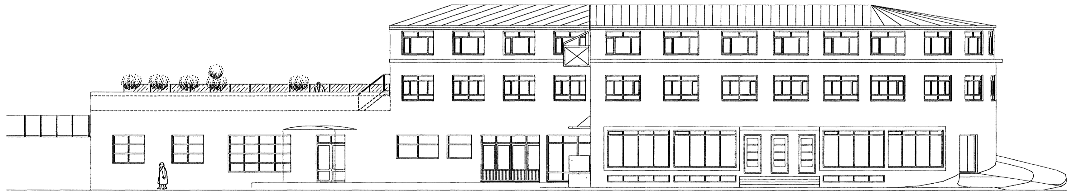
Útlit norð- vestur 1: 100