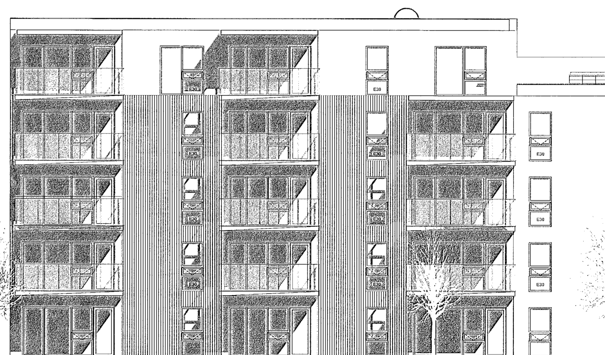
Austurútlit hús B