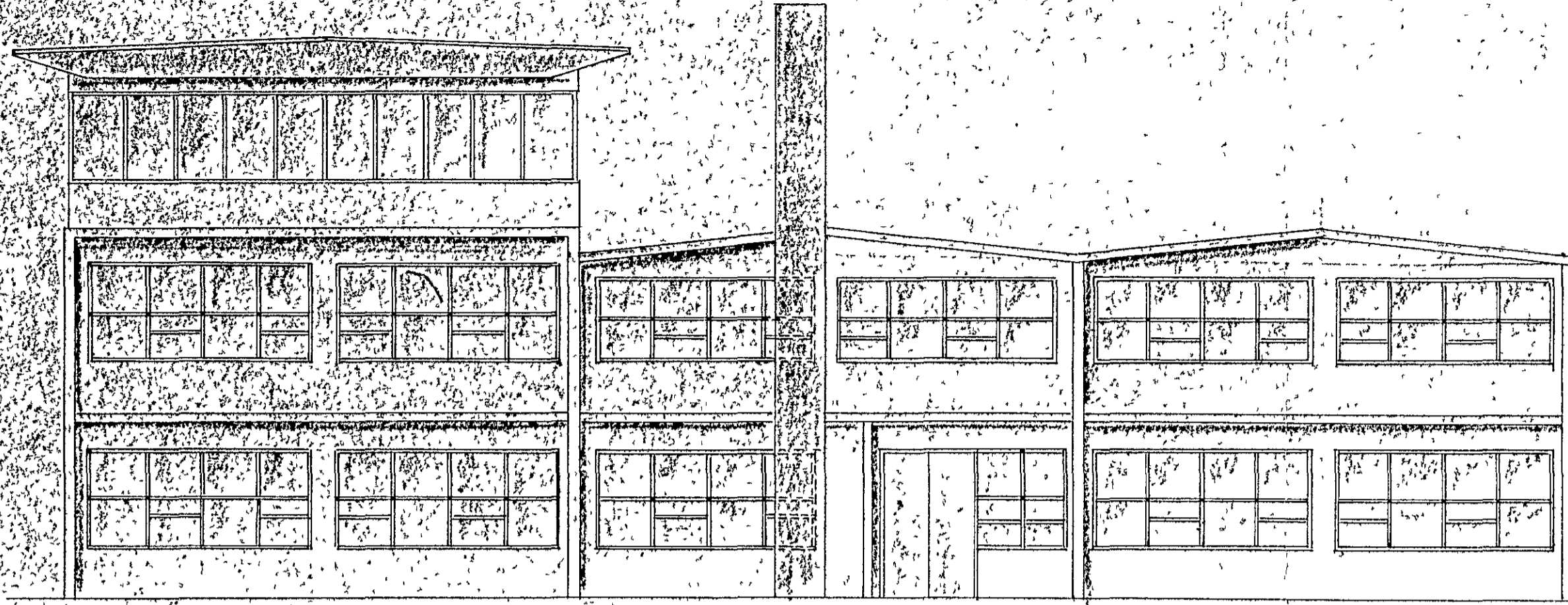
GAFL AD SUDURGÖTU