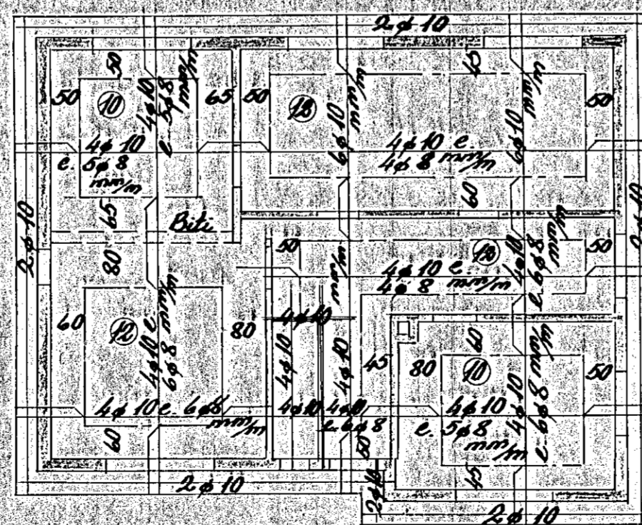
Loft yfir 2. hæð 1:100