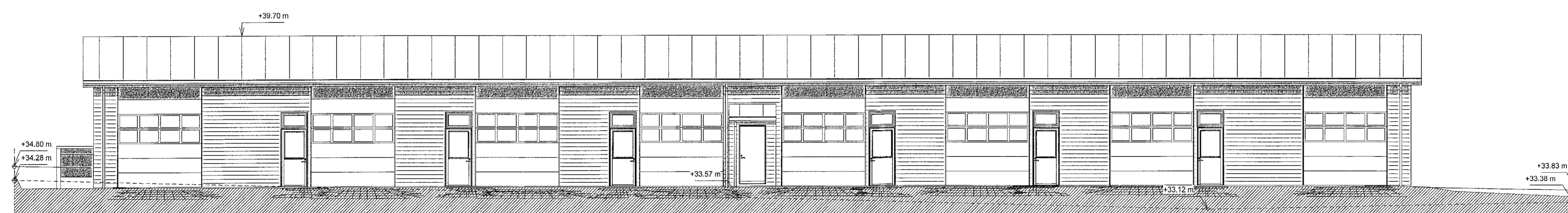
Austurhlíð 1 : 100