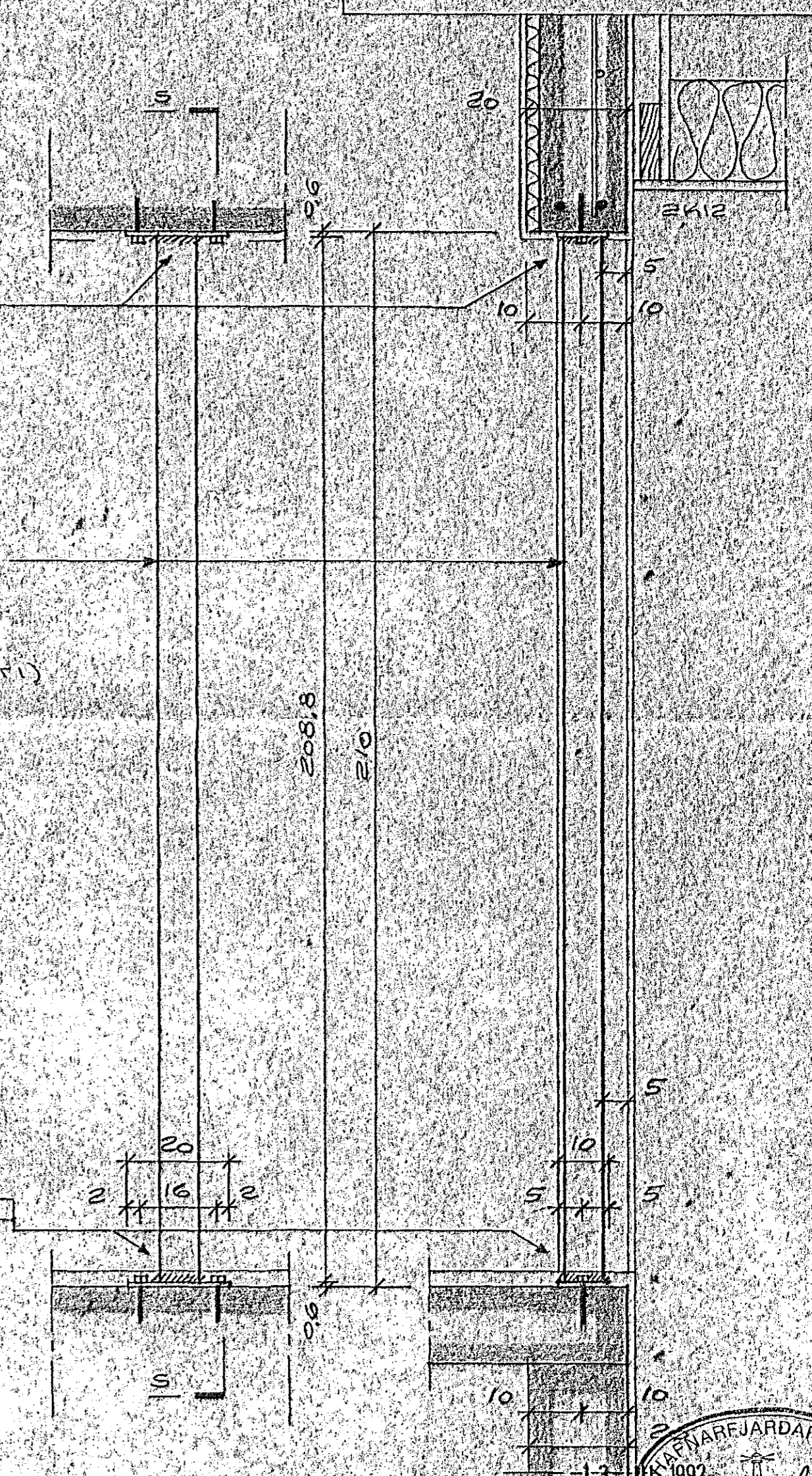
STÁLEULA M=1:10 SNID S-S, M