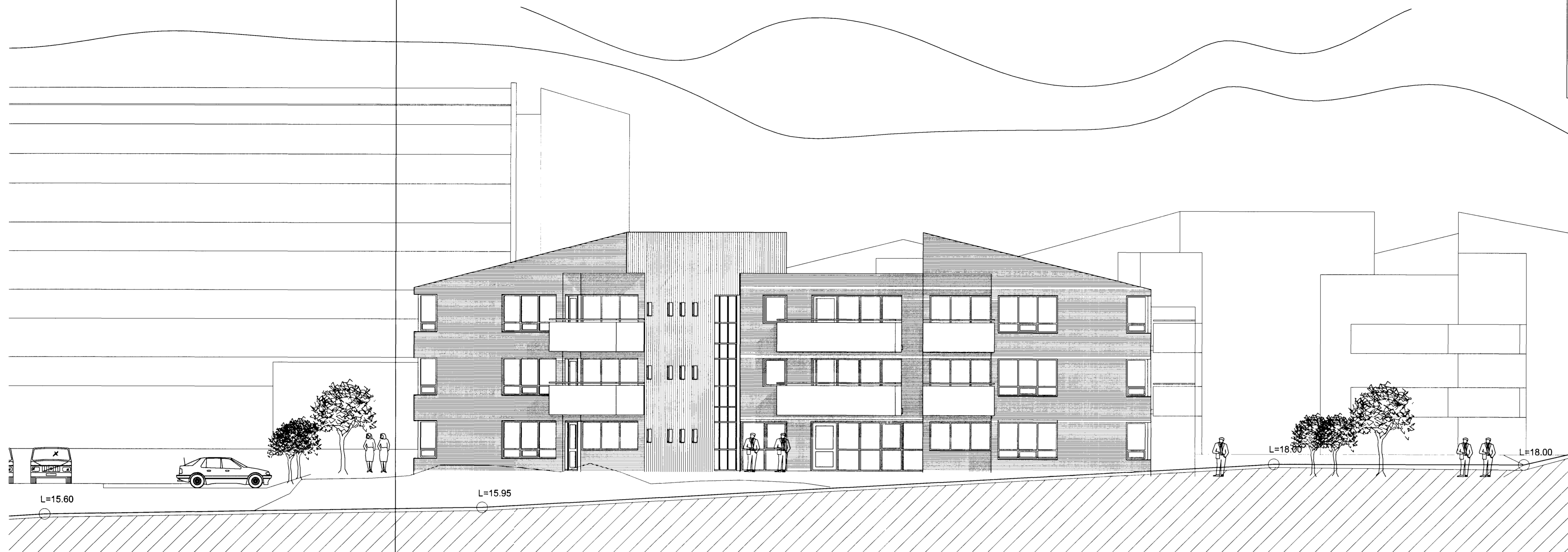
HÚS 2 - ÚTLIT - SUÐUR 1:100