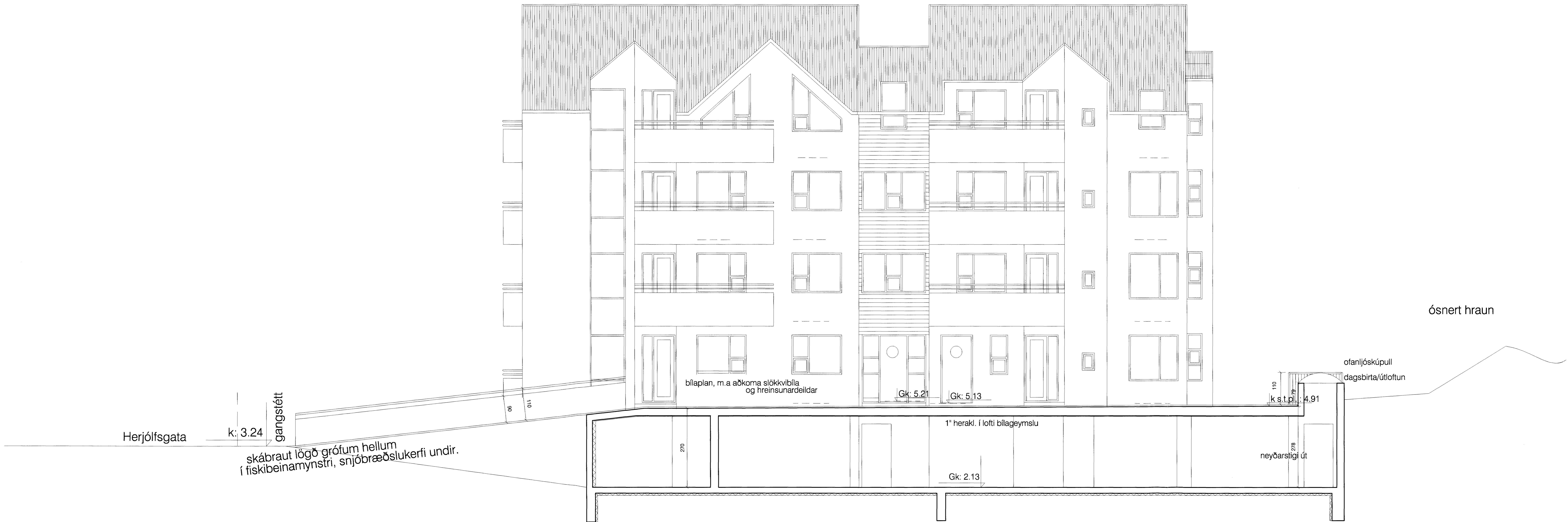
sneiðing C-C í í bílag.