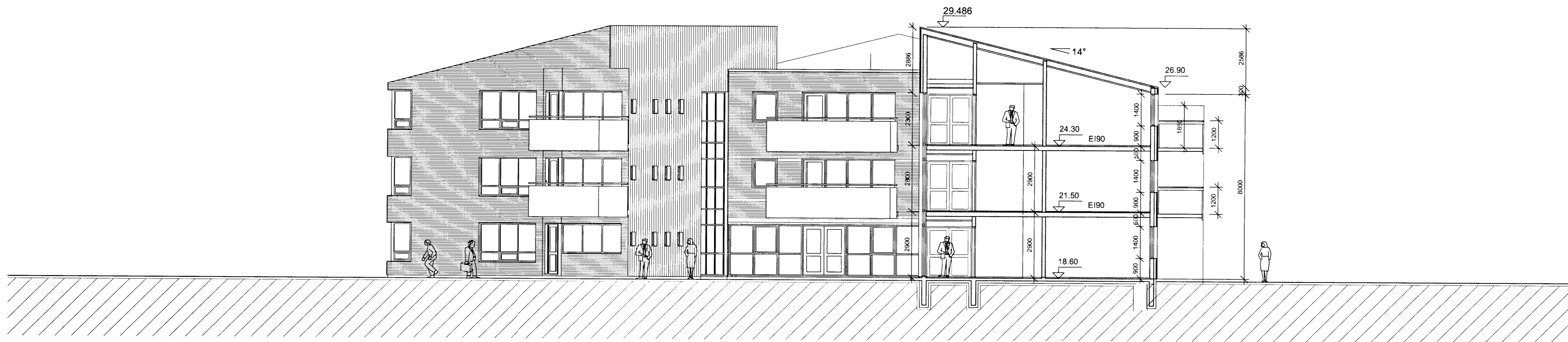
HÚS 1 - SNID C-C 1:100