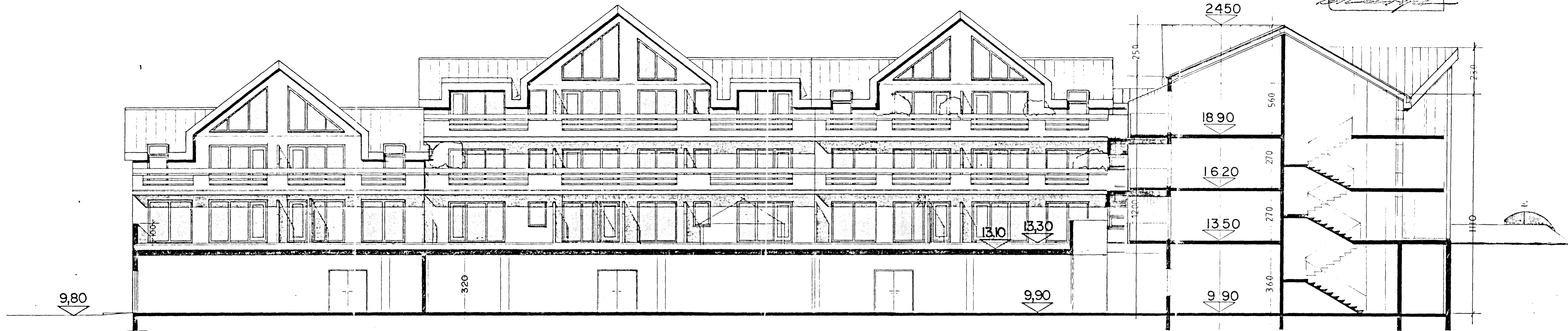
ÚTLIT SUÐUR SKURÐUR A-A.

Gerðbygging & fundi bygg reftölur: p. 17, 5 13/12/90 EYBODHAF HAFNAERFIDI