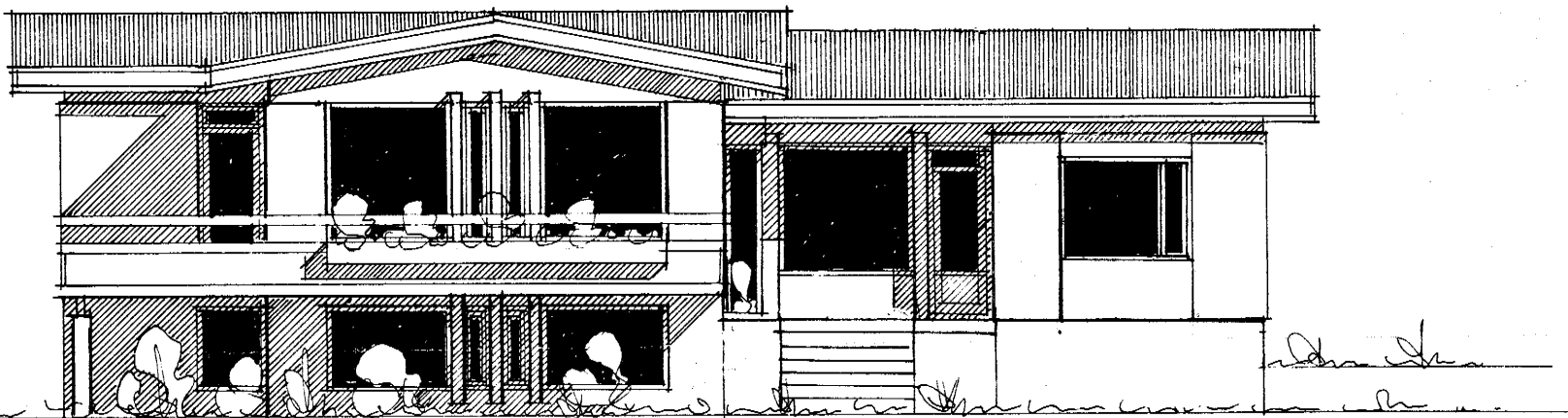
SU - AUSTUR